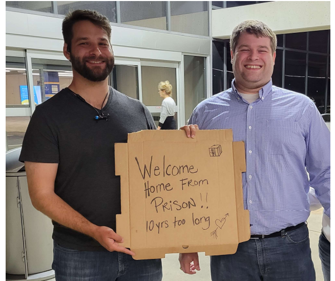
This welcome message got a few stares at the airport.