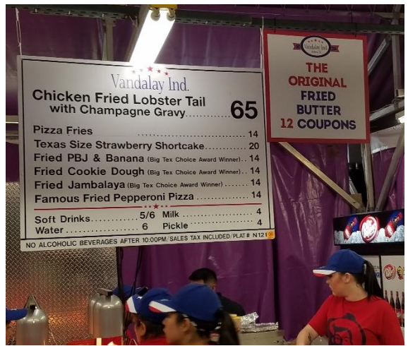
There are sooooo many things wrong with this picture. BUT, the deep-fried cheesecake-stuffed, chocolate-covered strawberry balls next door were awesome!

Texas boasts one of the largest state fairs, and regional cuisine is on full display. There is only one kitchen appliance required, a deep fryer. This particular fine dining establishment advertises the original fried butter, because you never know when your chicken-fried butter might be a knock-off.