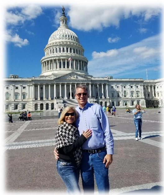
Have a Merry Christmas!