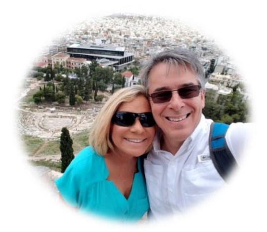
Celebrating our 30th in Greece

June marked our 30th anniversary. The expected idioms apply, such as "It feels like yesterday" and "Time flies when you're having fun." However, the reality is that we're still the same kids as 1987; we just have to act grown up at work (to get paid) and in front of children (to prevent extended therapy bills).