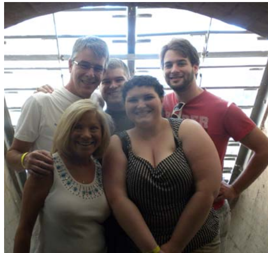
Hoover Dam - From the Inside Out