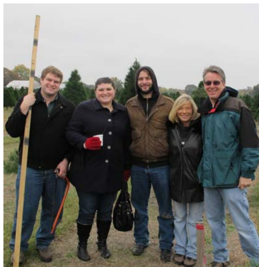
The Family Tradition Continues

We hope this festive season finds you healthy and happy, and looking forward to 2014. It's been three years since our last Christmas newsletter. Rather than offer excuses for interrupting your subscription to "Days of Duelm," we'll just share a few stories to catch you up.