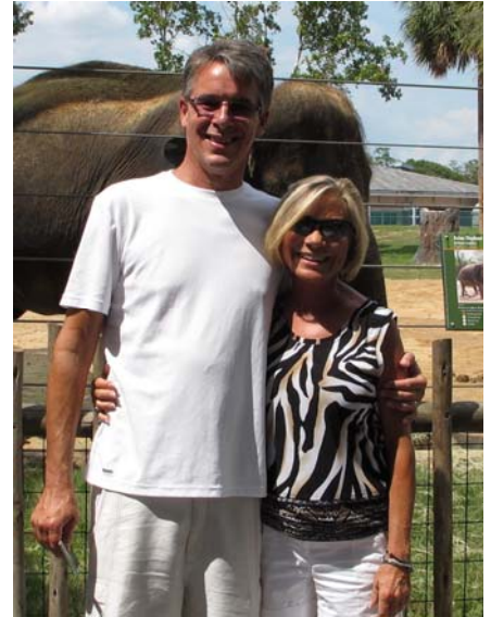
At the Houston Zoo

Sometimes you just don’t catch the significance of a picture until you see it later. We now understand why someone asked which side of the fence the exhibit was on.