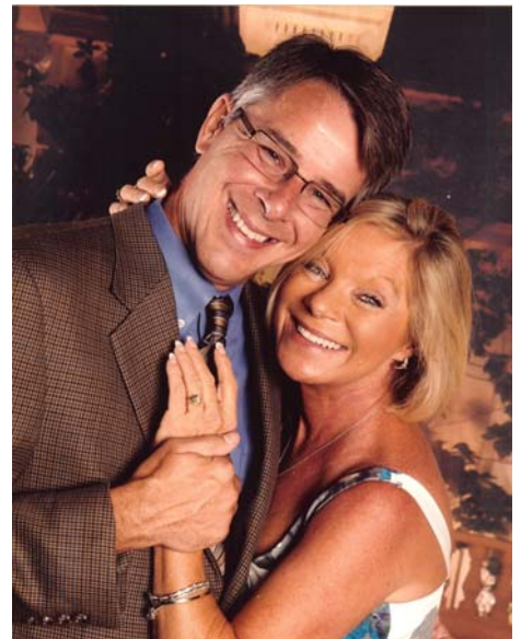
Celebrating 25 Years

One of us is growing silver, and the other might be, but the world will never know. Together we celebrated our 25 th wedding anniversary in 2012.